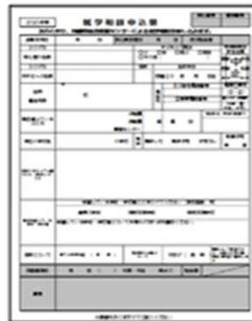
Application Form B