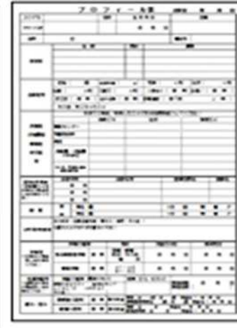
A copy of Profile Form